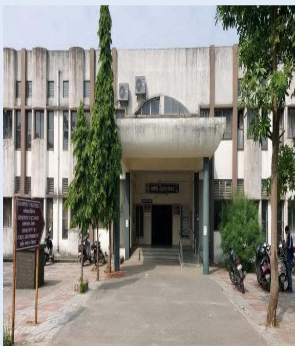
Department Main Building