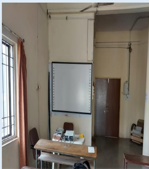
Classroom with Smart Board