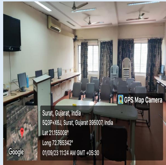
Department Computer Lab