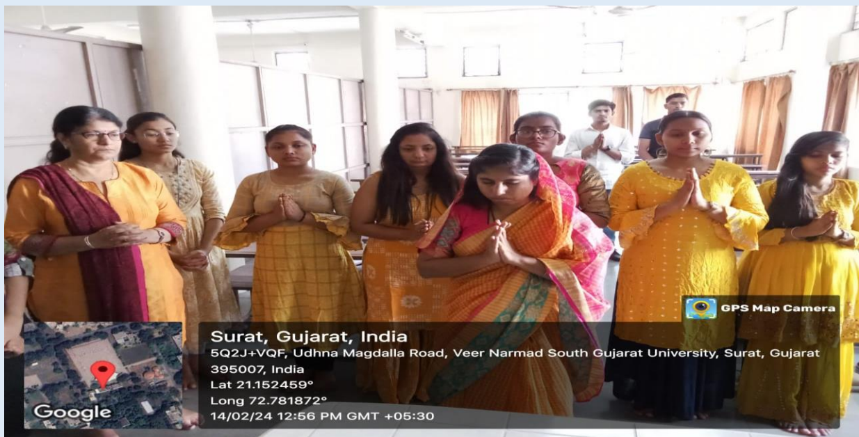
VASANT PANCHMI POOJAN