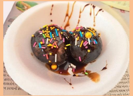
Food Stall at Youth Festival