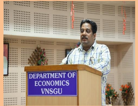
World Population Day