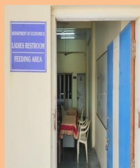
Ladies Rest Room Feeding Area