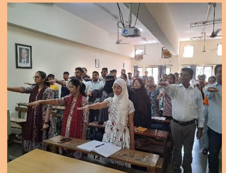
Bharat Vikas Pratigya