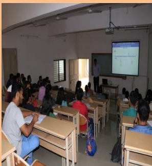
Spacious Classrooms With DLP Projectors

The Department of economics has a dedicated Ladies' Rest room to cater to over 90 percent of the girls' students in the department. The furnished room has the facility like cradle for new born, dressing table and two beds for any health emergencies. This apart it has also feeding area for nursing mothers. The department has also purchased a sanitary pad vending machine apart from incinerator to burn the used pads. Recently the department could purchase 70 desktops for a newly refurbished computer laboratory in the department. The department also houses a beautiful seminar hall catering to an audience of around 150 persons. The hall is one of the most sought after one on the campus for various academic and cultural purposes.