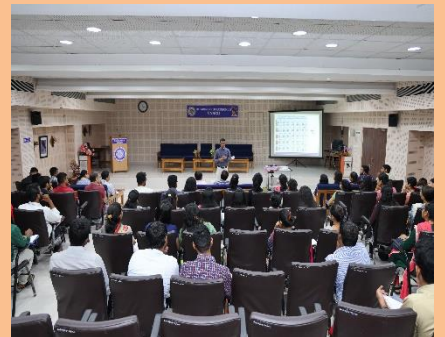
Six Days Workshop on Research Methodology