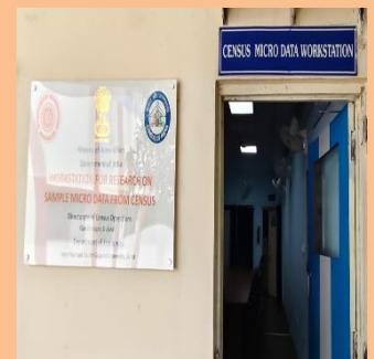
Census Micro Data Workstation