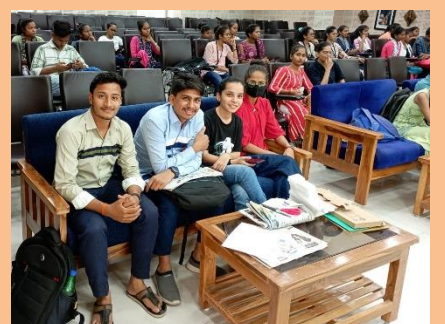
Best out of Waste Competition