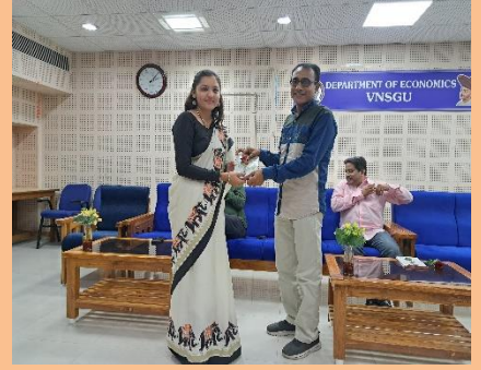
Guru Purnima Celebration