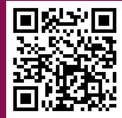
SCAN TO REGISTER FOR PLACEMENT

Regestartion link for this year's placement drive