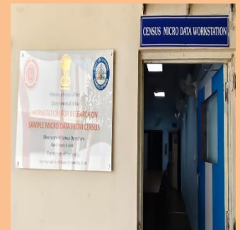
Census Micro Data Workstation