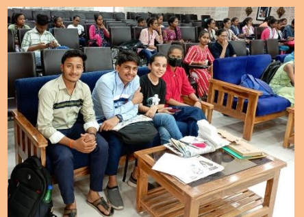
Best out of Waste Competition