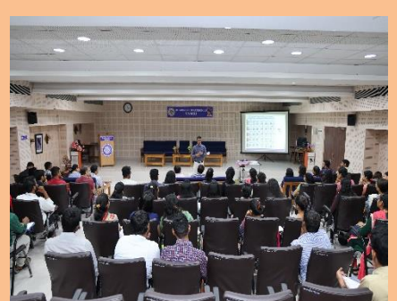
Six Days Workshop on Research Methodology