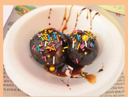
Food Stall at Youth Festival