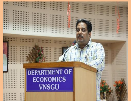
World Population Day