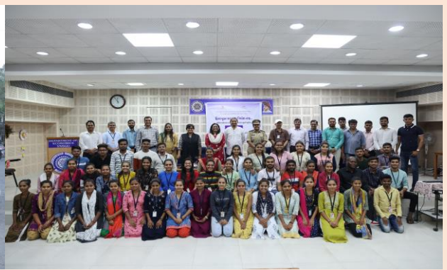
Seminar on Hinsa Mukta Samaj Nirman