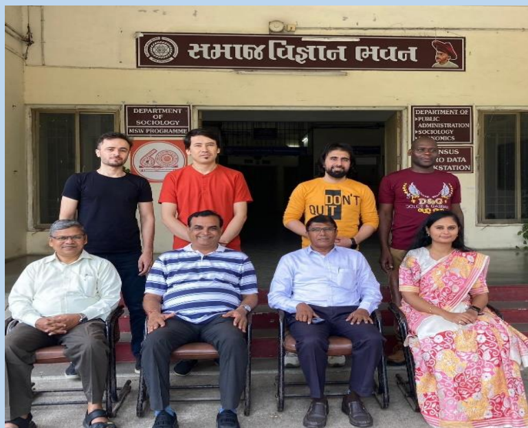
Teaching Staff Photos with Foreign Students Ph.D. Programme Registered under the ICCR Fellowship