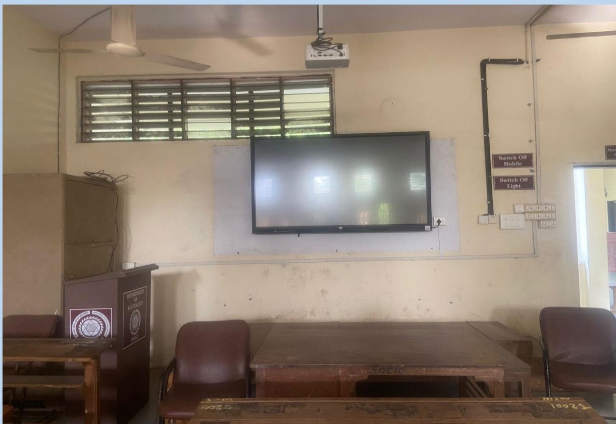
The Department has four Classrooms well equipped with ICT, LCD Projectors and Interactive Panel.