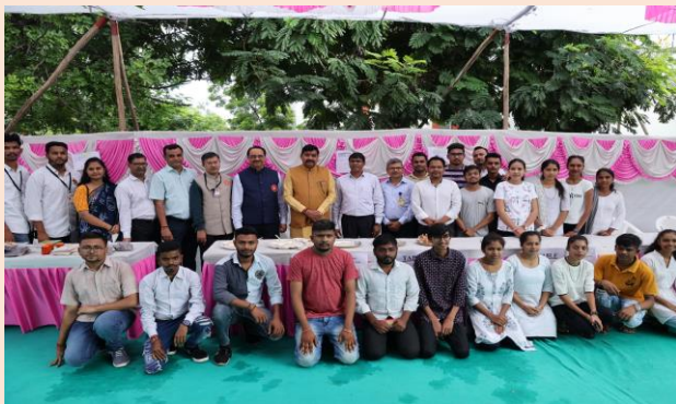
Eat Right Millet Mela