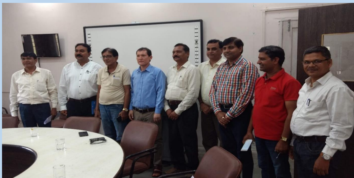
Foreign Student from Afghanistan Ph.D. Completion Photo with Faculty

Infrastructure and amenities of the Department: