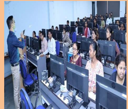
One Day Workshop On Reference Management Software