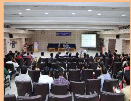
Six Days Workshop on Research Methodology