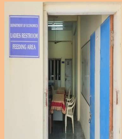
Ladies Rest Room Feeding Area