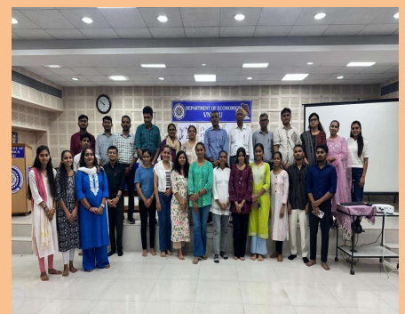
National Librarian Day