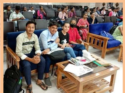
Best out of Waste Competition