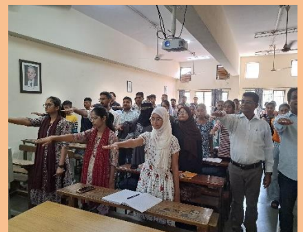
Bharat Vikas Pratigya