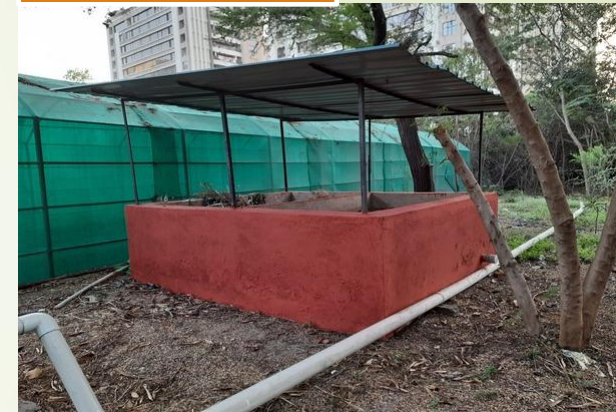
Vermi compost pit