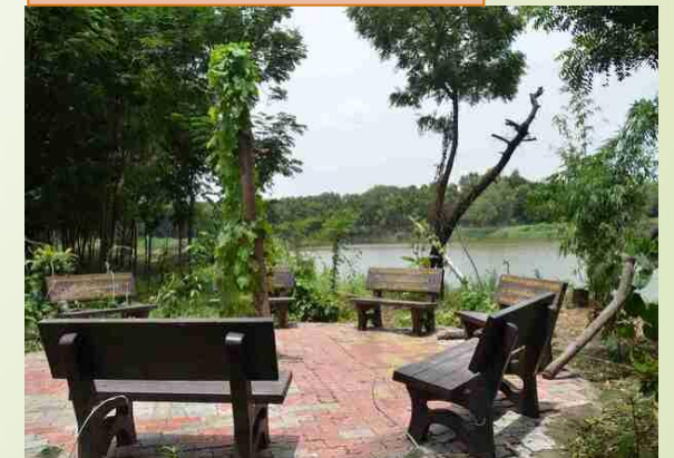
Open campus space