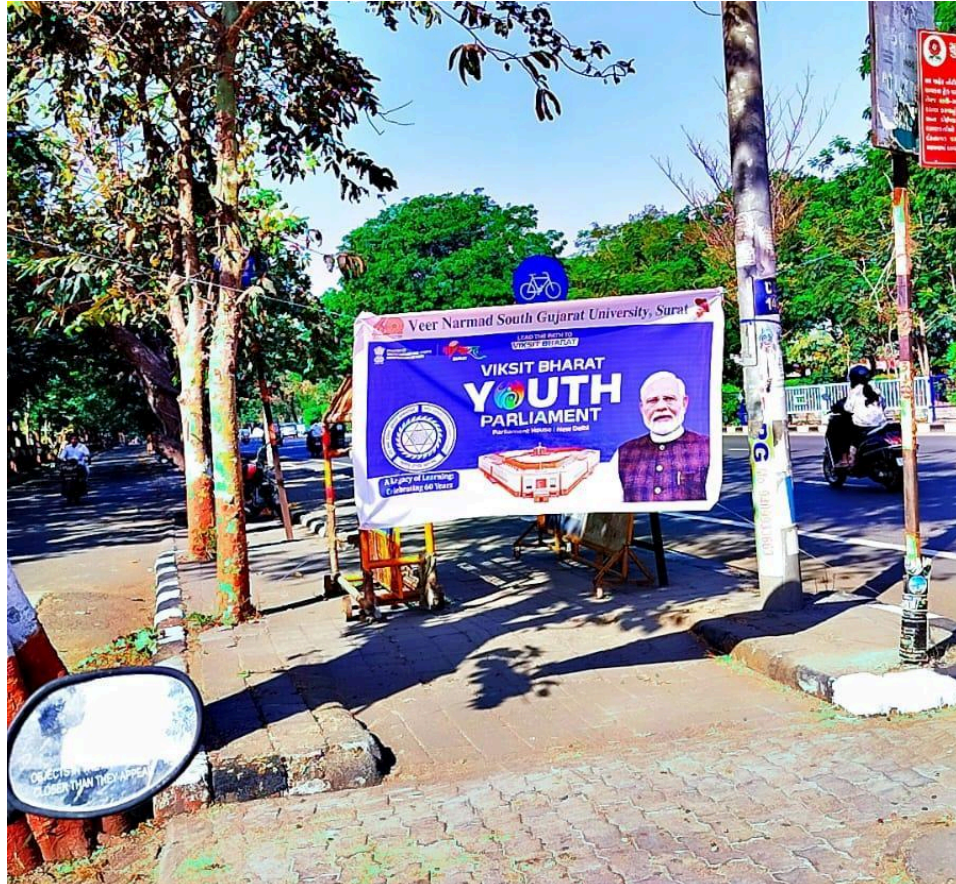
VNSGU Landing Page